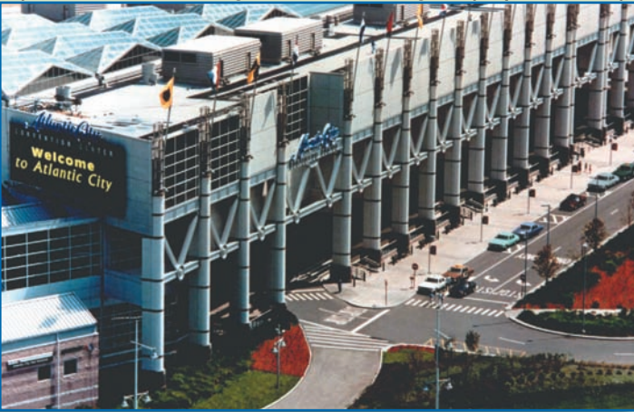
Atlantic City Convention Center

Space will be assigned according to physical requirements and postmark date of the application.